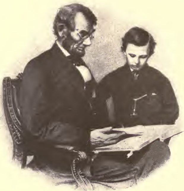
PRESIDENT LINCOLN AND HIS SON "TAD."